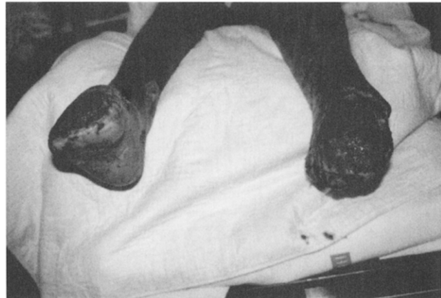
FIGURE 4 Appearance of lower extremities following first debridement.