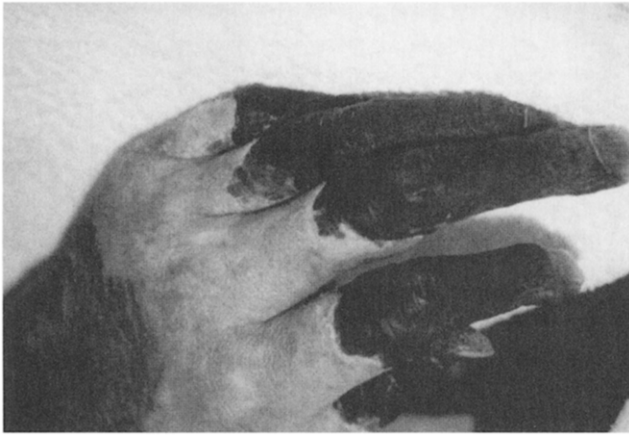
FIGURE 1 Left hand showing distal mummification of digits.