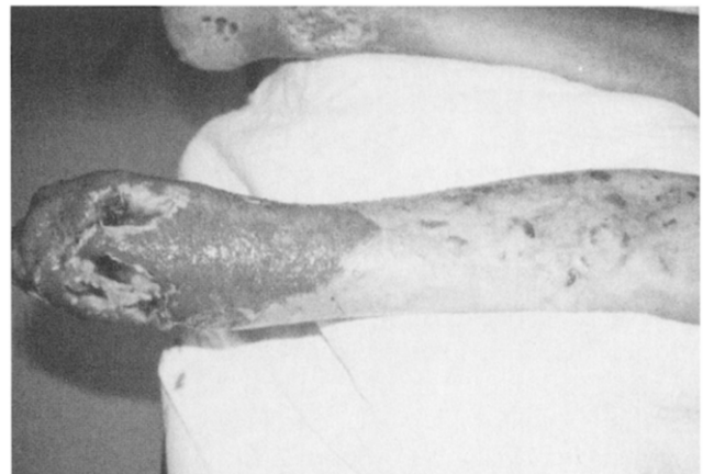
FIGURE 5 Preoperative left leg for below-knee amputation.

after streptococcal toxic shock-like syndrome (22). The incidence in adults has been reported to be from 2.6 to 4.3 per 100,000 population (22, 23). Interestingly, the incidence of staphylococcal toxic shock syndrome during the peak of the early 1980s epidemic was 8 to 14 per 100,000 (21), whereas today, the incidence is closer to between 1 and 2 per 100,000. Women aged 15 through 44 years are at a higher risk due to menstruation, as are whites, who account for 80% of the nonmenstrual cases reported (21). In the postoperative setting, the threat exists, although it is extremely low. A 12-year retrospective review studied 390,000 surgical procedures and found an incidence of staphylococcal toxic shock syndrome to be only 0.003% (12 cases) (13).