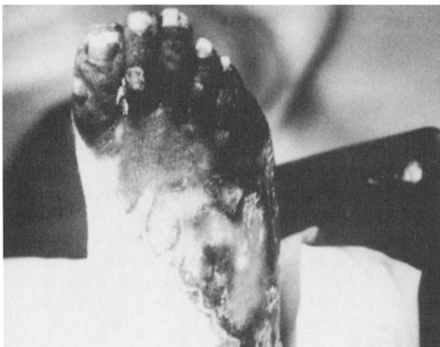
FIGURE 2 Right foot showing progression of ischemia. Note the second digit, where injury occurred.