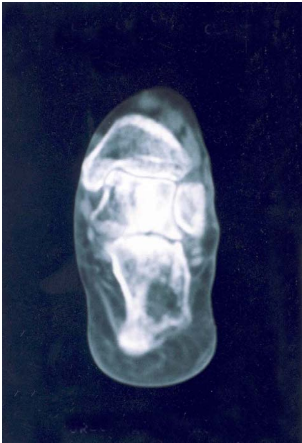
Figure 1 CT scan revealed joint narrowing consistent with degenerative arthritis. A large area of bone lysis is seen in the body of the os calcis.

Hematogenous septic arthritis may be secondary to upper respiratory and skin infections, most frequently encountered with gram-positive organisms. 8