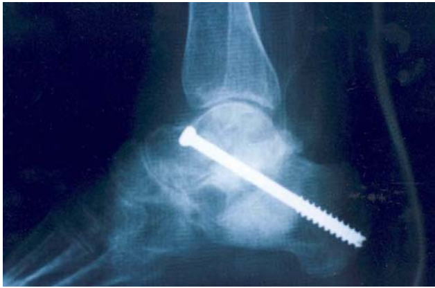
Figure 4 Iliac bone graft is used with a single cannulated cancellous screw to fuse the subtalar joint.

Ten weeks after debridement of the left talus and calcaneus, the beads were removed. The residual bone of the talus and calcaneus were clinically viable, and a subtalar joint fusion with talar and calcaneal reconstruction using autogenic iliac bone graft was performed. The patient was placed in a below-the-knee cast. Plain film findings two weeks after STJ fusion demonstrated intact internal fixation from anterior dorsal to plantar posterior with good placement and joint alignment. A portion of increased density of both the talus and calcaneus corresponded to generalized osteopenia of the bone grafts. (Fig. 4) Intravenous antibiotics were discontinued and the patient was put on a two-week course of oral cephalexin.