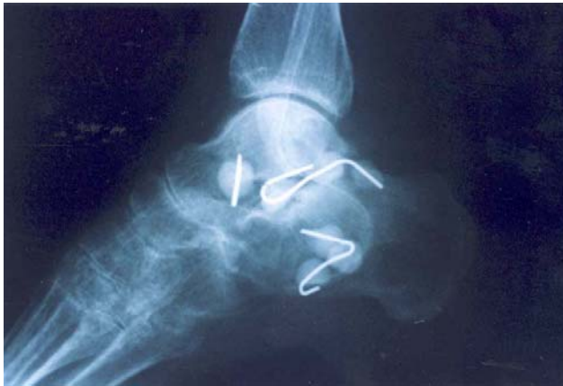
Figure 2 Following surgical debridement of osteomyelitic bone, antibiotic impregnated PMMA beads were inserted. Cultures revealed staphylococcus aureus osteomyelitis.

Plain films of the left foot and ankle, taken on a previous presentation did not reveal a fracture or dislocation, although there was significant degenerative joint disease of the left ankle joint.